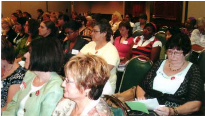
Candidates Night participants hear candidates address their issues and concerns